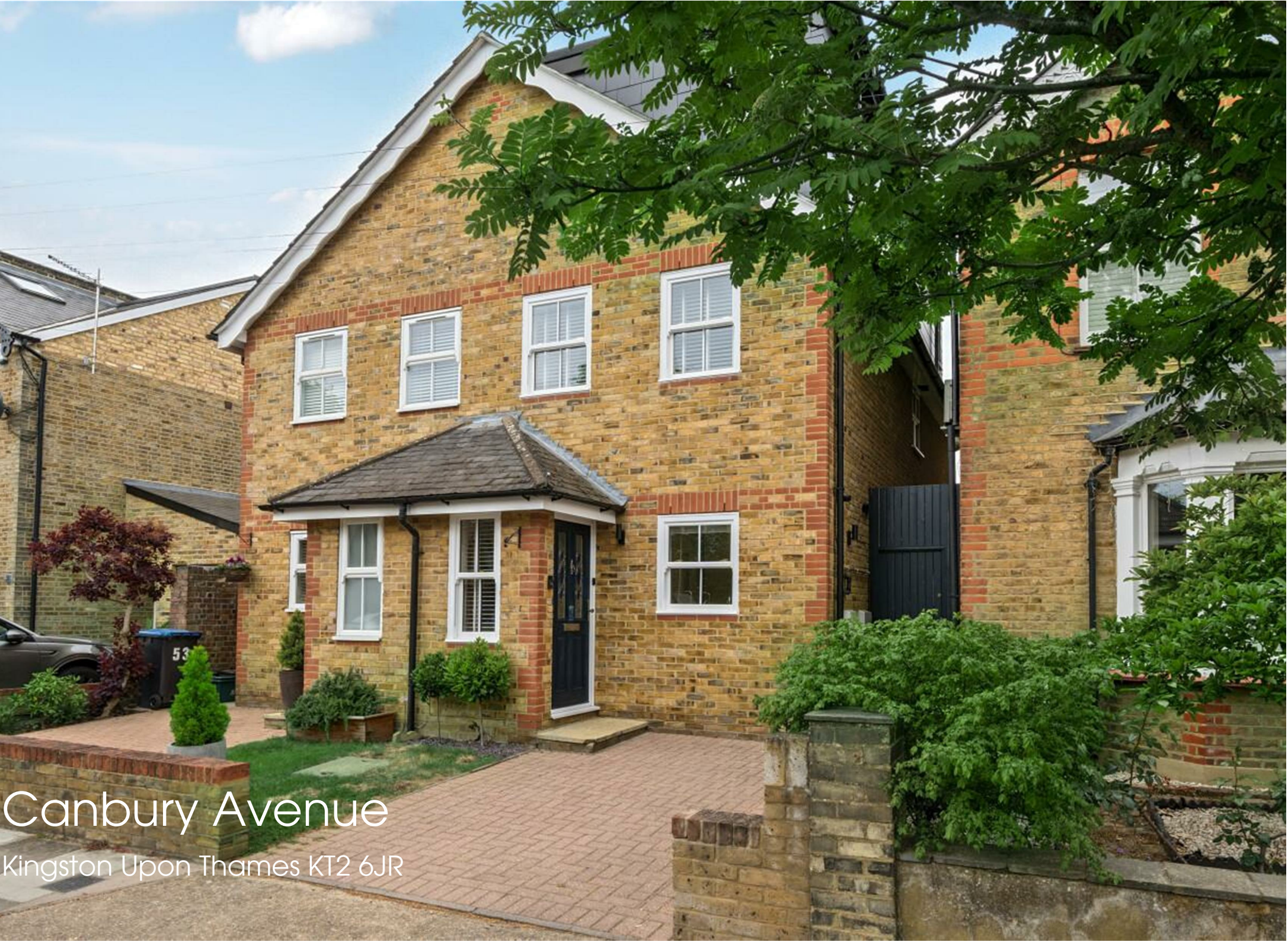
Canbury Avenue Kingston Upon Thames KT2 6JR